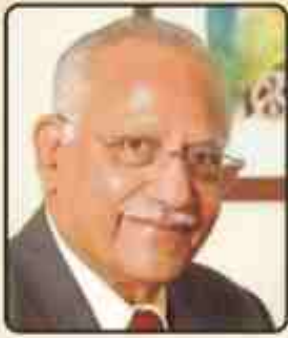
Dr. Pratap Reddy Padma Vibhushan